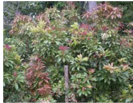
ANDROMEDA 'MOUNTAIN FIRE'