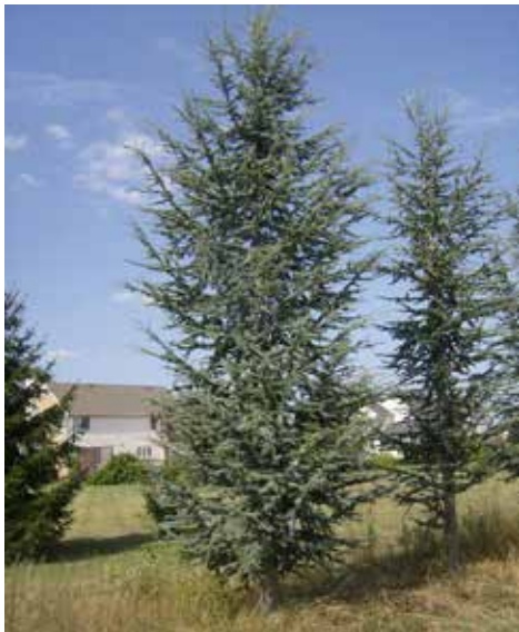
BLUE ATLAS CEDAR