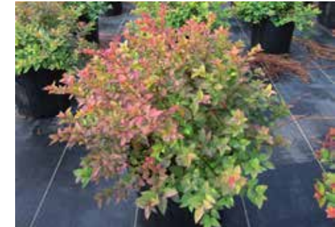
SPIRAEA 'MAGIC CARPET'