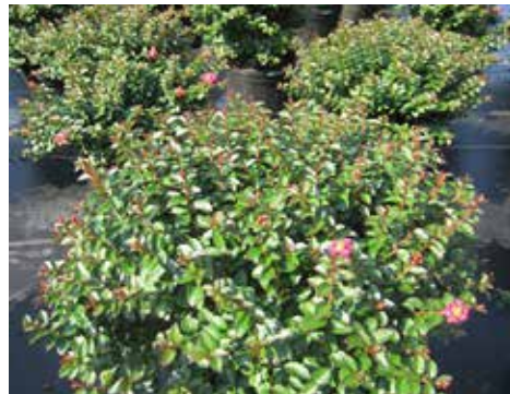
POCOMOKE DWARF CRAPE MYRTLE