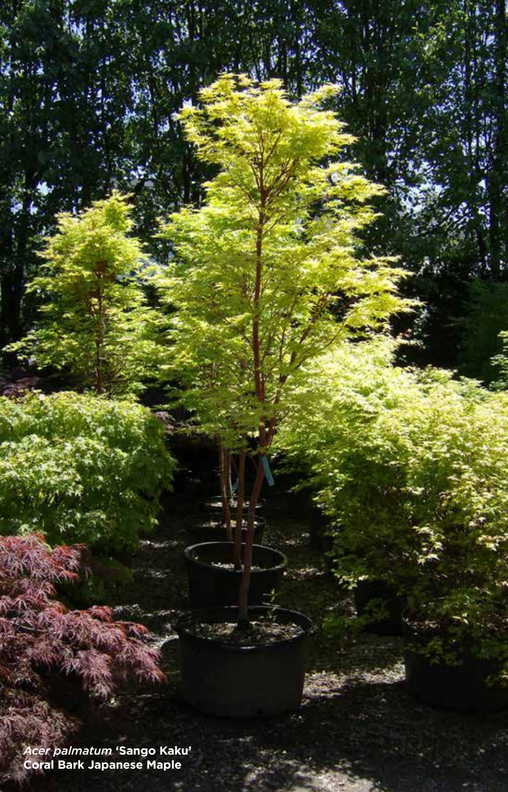
Acer palmatum 'Sango Kaku' Coral Bark Japanese Maple