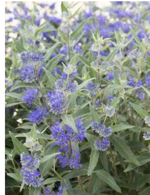
BLUE MIST SHRUB

CARYOPTERIS clandonensis Blue Mist Shrub Attractive compact, mounding grower with fragrant powder blue blooms. Long blooming season during the summer. Creates a wonderful border for perennial beds, or use along walks and entryways. Reaches 2.5-3' tall and wide. Deciduous.