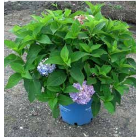
HYDRANGEA ENDLESS SUMMER

HOSTA 1 Gal ..... 12.00 2 Gal ..... 14.50