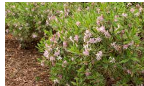
CAROL MACKIE DAPHNE

Carol Mackie Daphne grows 3-4 feet tall and at least as wide. Typically it has a dense, round, mounded form. The small, narrow, leaves edged in gold to creamy white remain fresh-looking throughout the growing season.