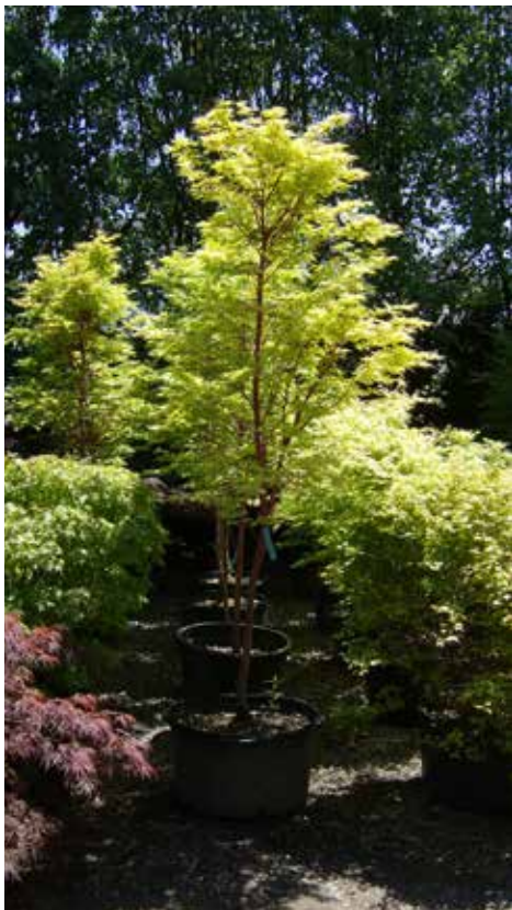
CORAL BARK JAPANESE MAPLE