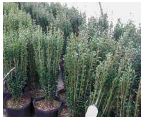
SKY PENCIL JAPANESE HOLLY