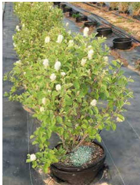
DWARF FOTHERGILLA 'MOUNT AIRY'