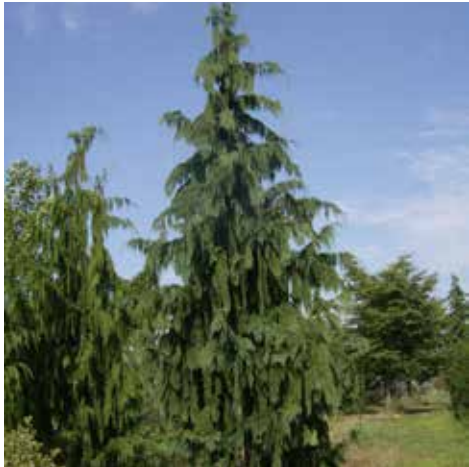
WEeping ALASKAN CEDAR

2 Gal . . . . .26.00 3 Gal . . . . .34.00