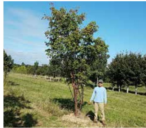
PAPER BARK MAPLE