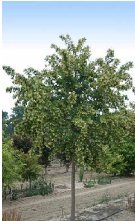
AMUR MAPLE 'FLAME'

Trees help to reduce ozone levels in urban areas. Trees sequester carbon, helping to remove carbon dioxide and other greenhouse gases from the air, which helps cool the earth. A single tree can be home to hundreds of species of birds, insects, fungi, moss, and mammals.