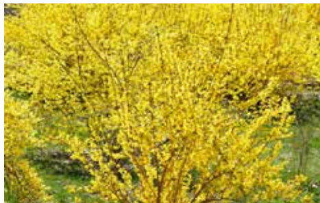
FORSYTHIA 'LYNWOOD GOLD'