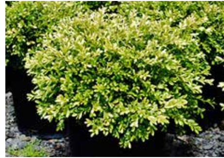
'FRANKLIN'S GEM' BOXWOOD