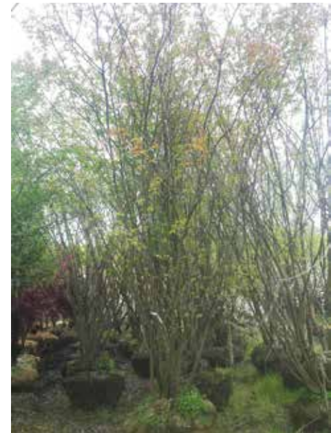
AUTUMN BRILLIANCE SERVICEBERRY

Serviceberry trees are one of the top bird attracting plants in North America. Many wild birds consume the nutrient dense fruits, including Cedar Waxwings and Gray Catbirds. Blooms in March and April (depending on location), with clusters of delicate white flowers, followed by berry-like fruit that ripen in June.