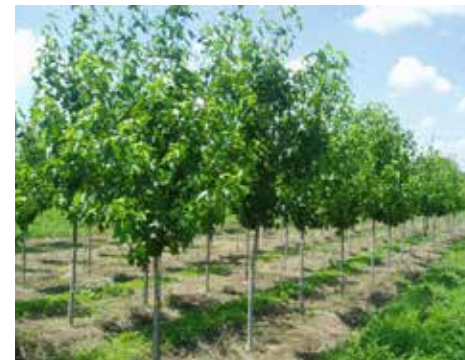
SEEDLESS SWEETGUM 'ROTUNDILOBA'