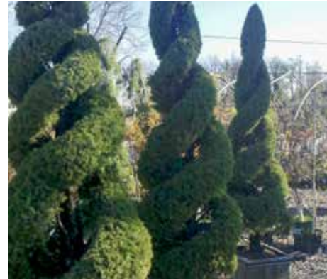
SPIRAL DWARF ALBERTA SPRUCE