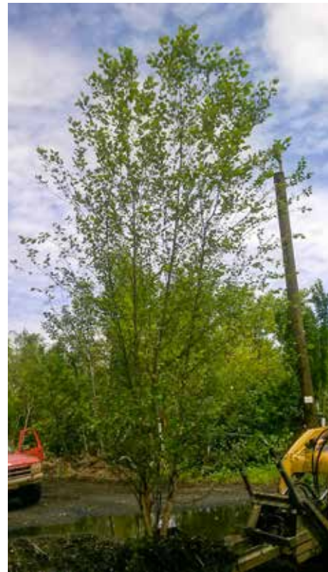
RIVER BIRCH 'HERITAGE'