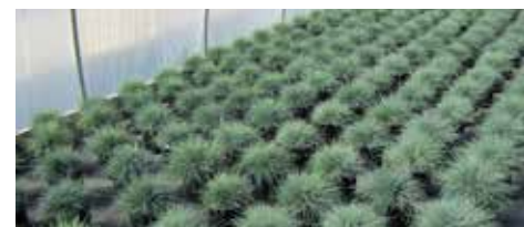
ELIJAH BLUE FESCUE