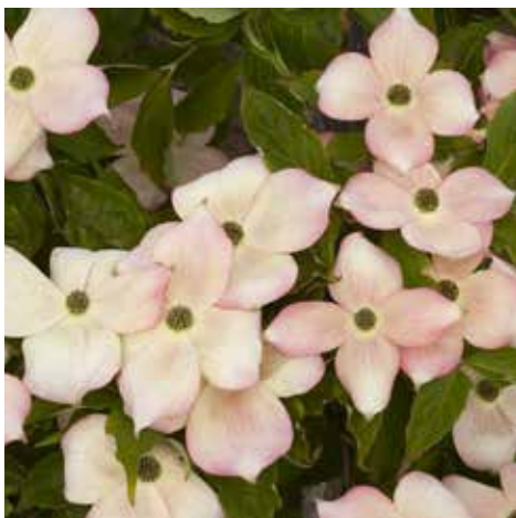
STELLAR PINK DOGWOOD