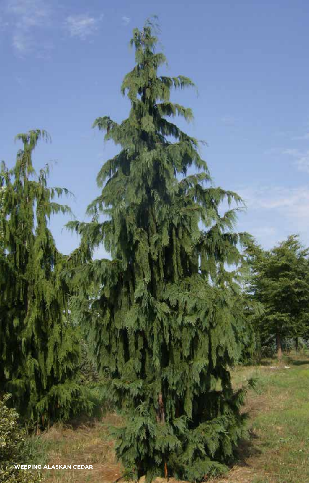
WEeping ALASKAN CEDAR