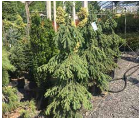
WEeping NORWAY SPRUCE

White Spruce, the state tree of South Dakota is great for shady areas or as a Christmas tree.