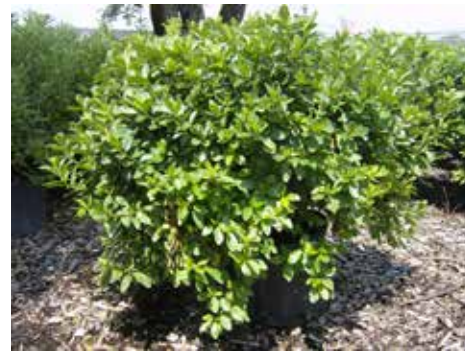
AZALEA - DELAWARE VALLEY WHITE