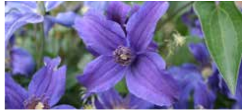
CLEMATIS 'SAPPHIRE INDIGO'

The dogwood, one of the most popular trees in the country, has showy white or pink flowers that herald the arrival of spring. Easy to grow, the dogwood readily thrives in the home landscape.