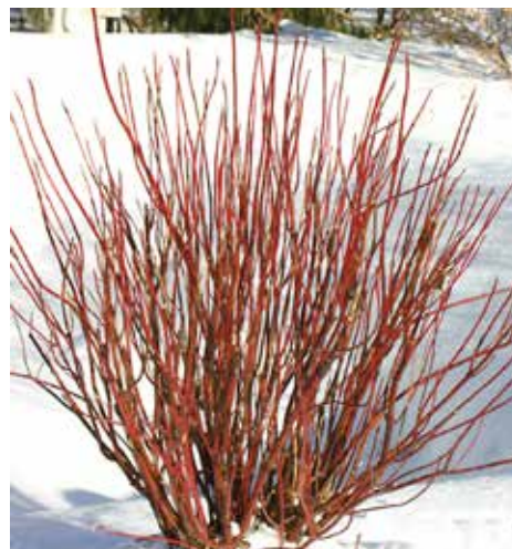
ARCTIC FIRE RED TWIG DOGWOOD