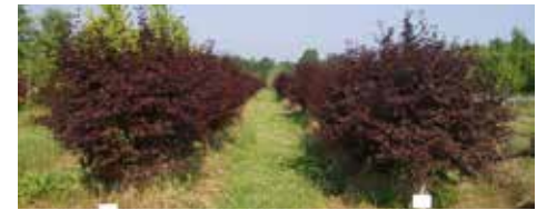
UPRIGHT JAPANESE MAPLE 'BLOODGOOD'

Japanese maples typically grow just one to two feet per year. Under the right conditions, they can live to be over a hundred years old!