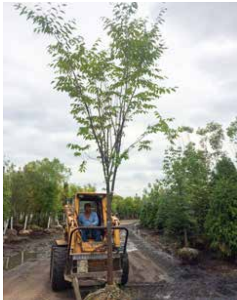
ZELKOVA 'GREEN VASE'

Yucca blooms during the spring and early summer. Flowers are oriented downwards during the day and orient themselves upwards during the night. The flowers release pleasant odor that is especially prominent during the night to attract yucca moths, responsible for the pollination of this plant.