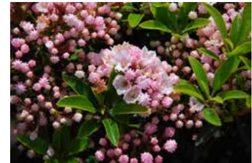
MOUNTAIN LAUREL 'ELF'