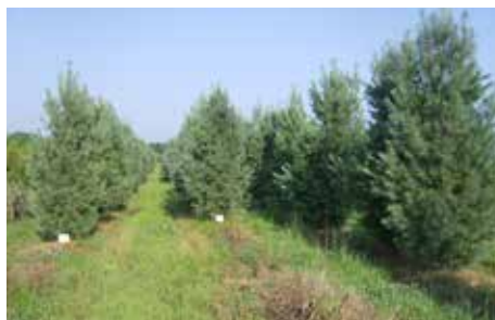
COLUMNAR WHITE PINE

Catalog pricing is based upon product from our farms, occasionally we must obtain product from other sources and the pricing will be adjusted accordingly.