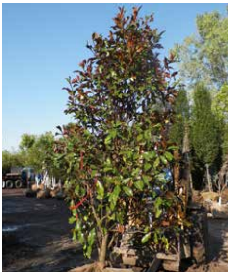
MAGNOLIA 'BRACKENS BROWN BEAUTY'

Magnolias bloom in April to June, and have a pleasant scent that resembles the smell of tropical fruit. The first flowers develop about seven years after planting, pollinated by bees. The cone-like brownish fruit can reach 2 to 10 inches in length, and the seeds are a favorite food of many birds.