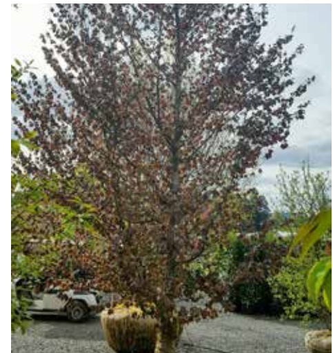
RIVER'S PURPLE BEECH