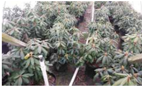
RHODODENDRON 'ROSEUM ELEGANS'