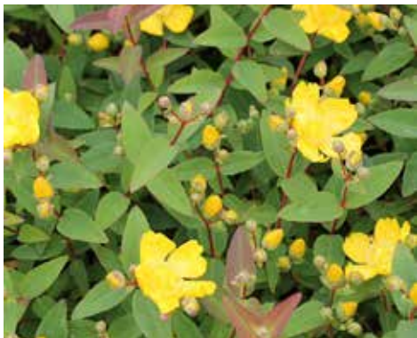
ST. JOHNS WORT 'HIDCOTE'