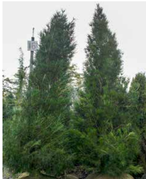
JAPANESE UMBRELLA PINE