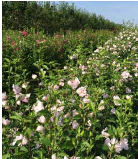
ROSE OF SHARON

Heptacodium miconioides Seven Son Flower A deciduous shrub with distinct three-veined leaves retained into early winter. Unusual peeling bark. Small, fragrant white flowers are followed by showy bright red calyx in fall. Best in shrub borders and foundation planting against a dark background. Fast growing to 20' tall and 10-15' wide 8-10' B&B ..... 225.00 10-12' B&B ..... 375.00 2-2.5" .....225.00 2.5-3" .....295.00